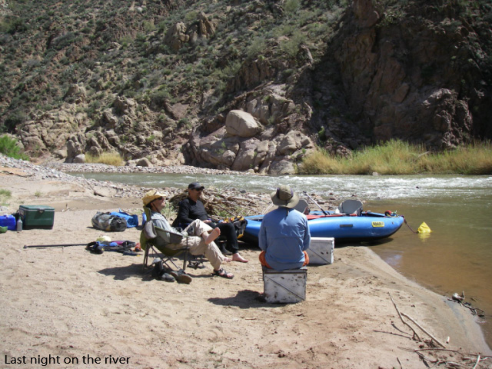
Last night on the river