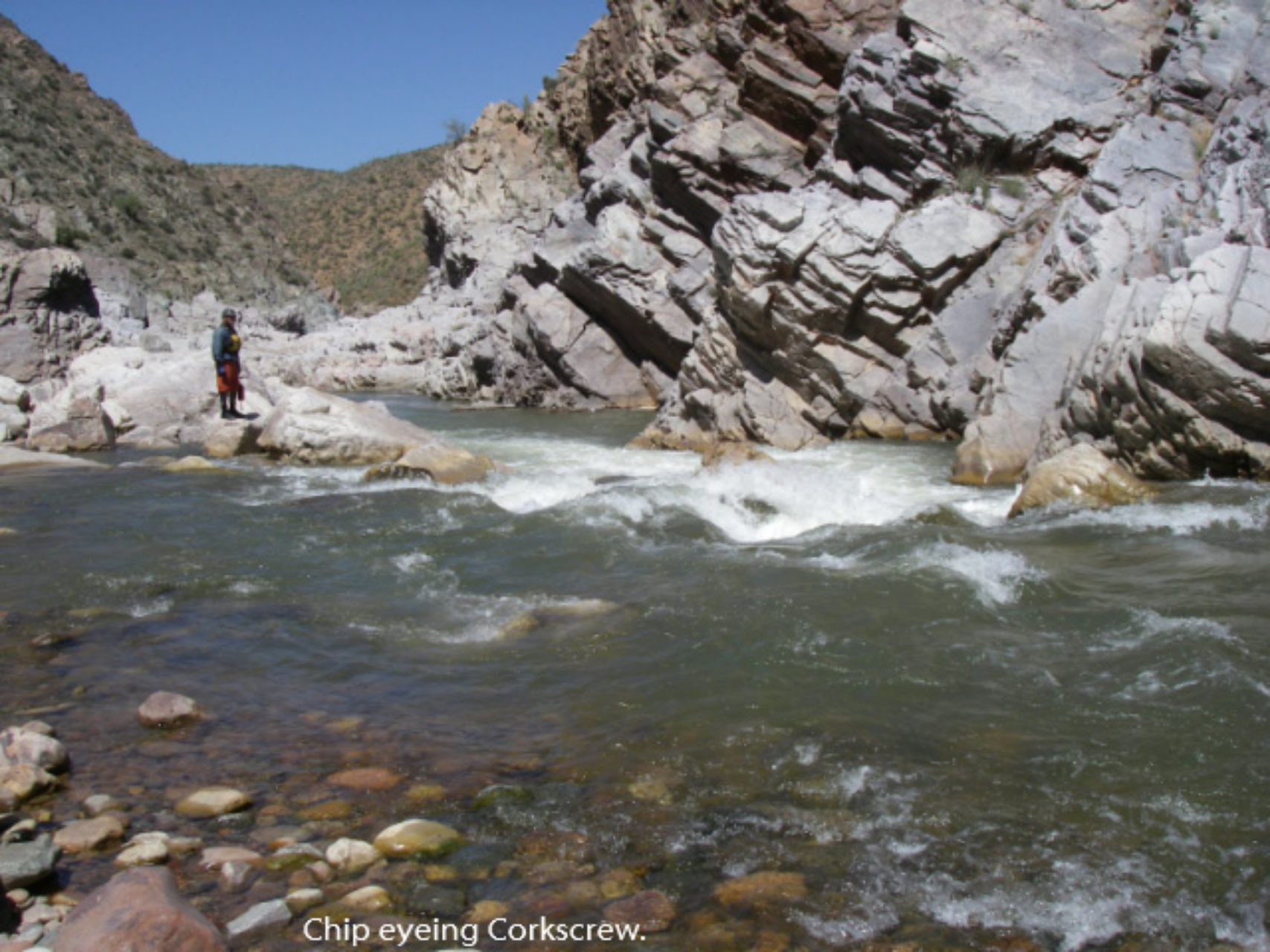
Chip eyeing Corkscrew.