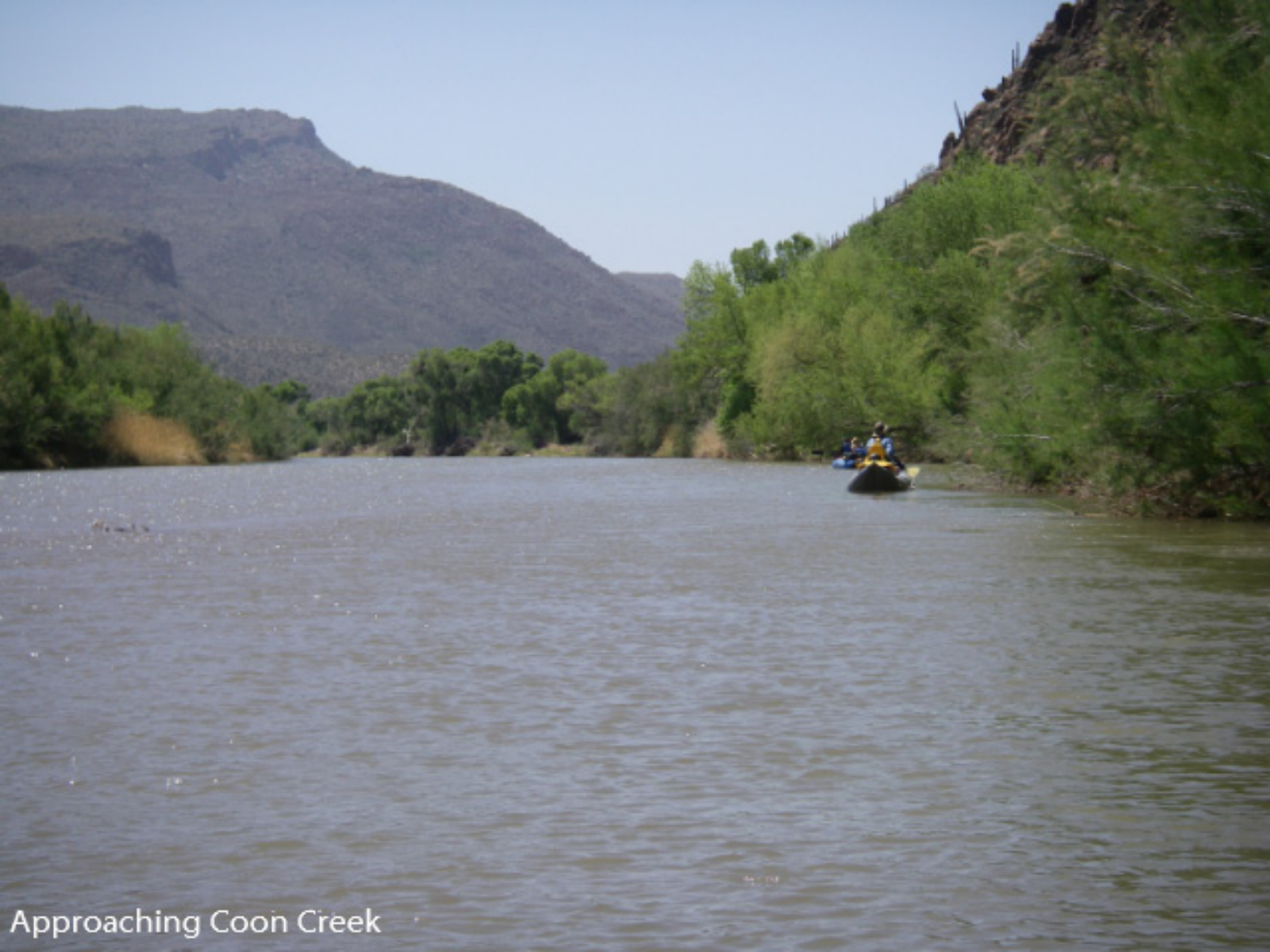
Approaching Coon Creek