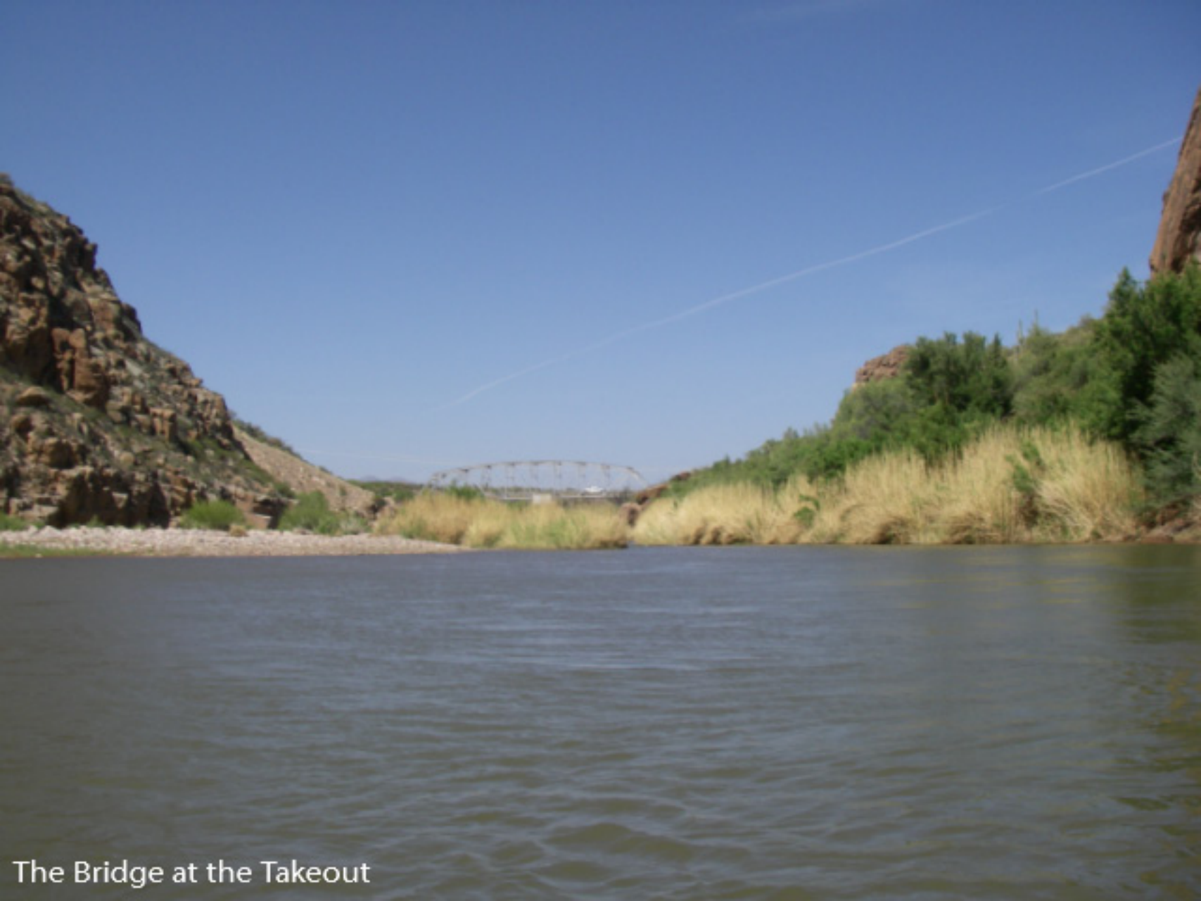
The Bridge at the Takeout