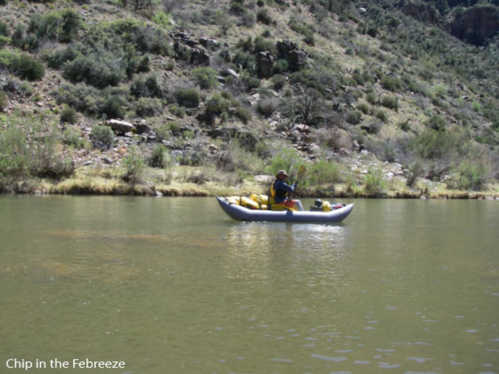
Chip in the Febreeze