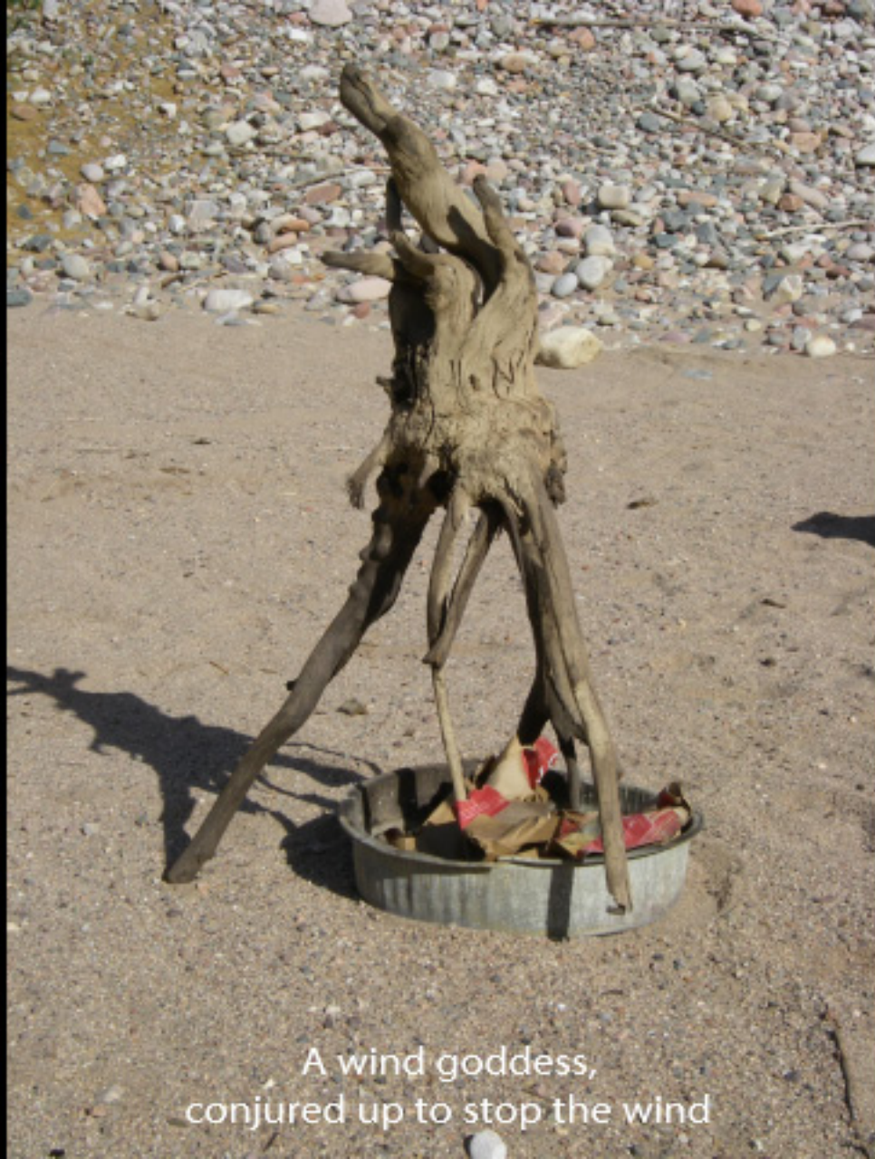
A wind goddess, conjured up to stop the wind