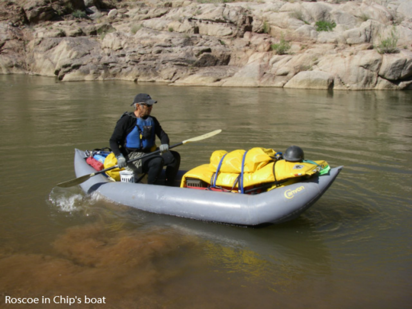
Roscoe in Chip's boat